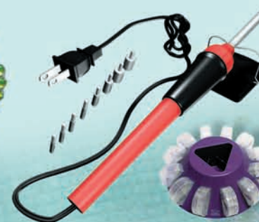
EZ Glitz Applicator Wand