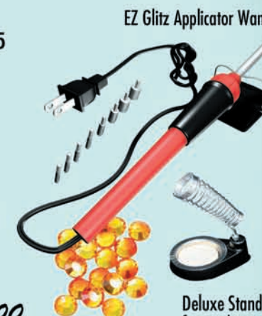
EZ Glitz Applicator Wand