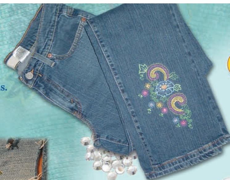
EZ Glitz Eclipse

Stones and other glitz currently adorn embroidered apparel in stores and catalogs. Do you have the tools to apply these popular auxiliary embellishments such as stones or studs? Check out these two pages about simple, inexpensive tools that can add excitement and charm to a wide variety of items.